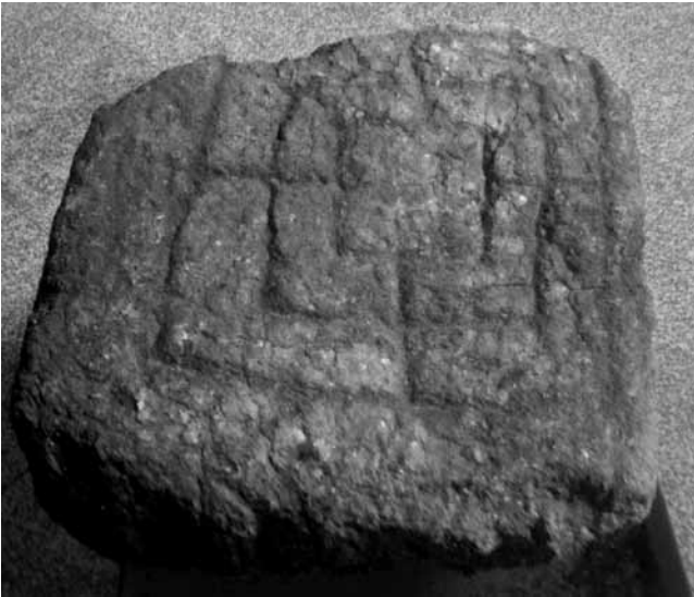
Fig. 3 - Portugal, Guarda, Méda, the “nine men’s morris” of Longroiva.