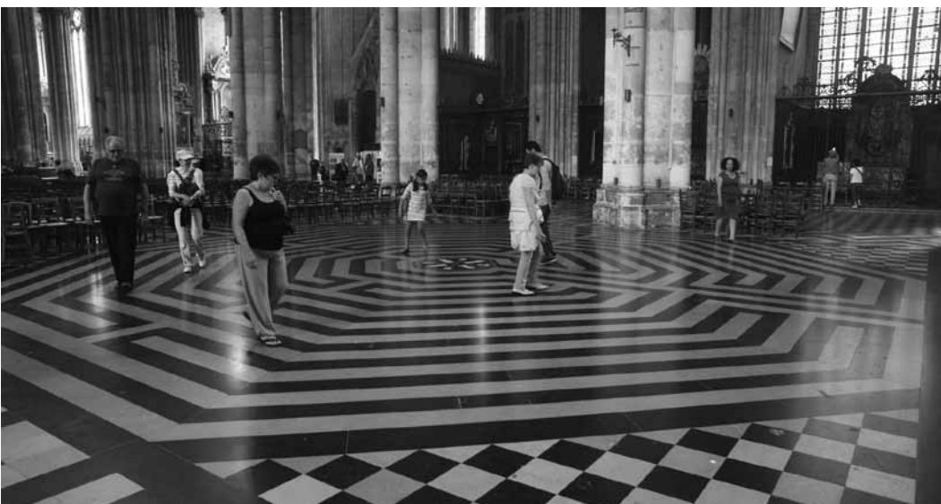
Fig. 6 - France, Amiens cathedral of Saint-Mary: the octagonal labyrinth on the floor of the central nave (1220-1288, rebuilt 1894).