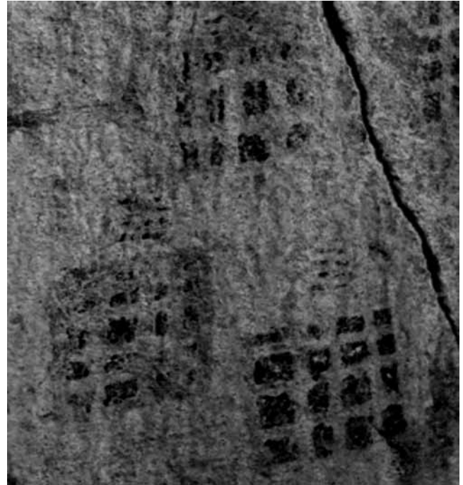
Fig. 1b - Portugal, Carrazeda de Ansiães, Douro, Cachão da Rapa, some of the painted figures that have been interpreted as possible game boards.