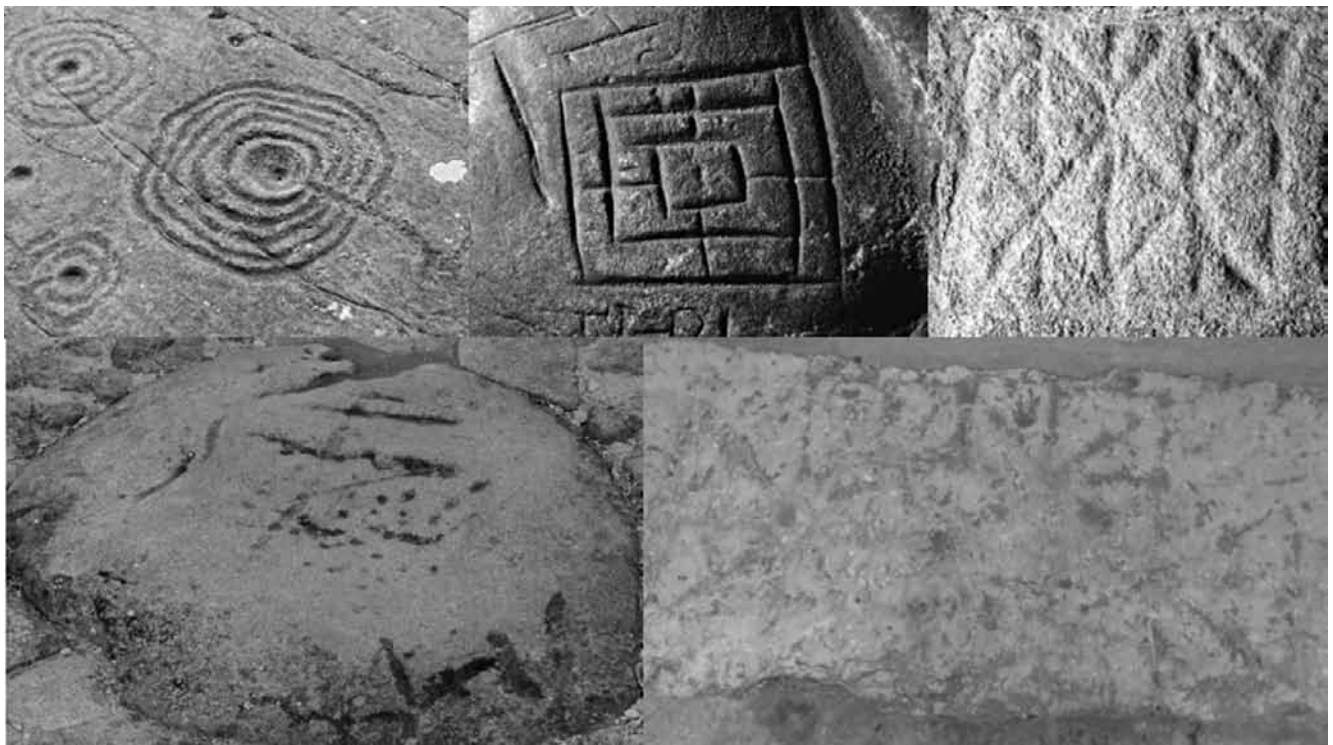
Fig. 2 - Examples of different types of nine men's morris, merels or mills. Upper row, from left to right A - United Kingdom, Wooler, Weetwood, Moor 3 (ERA 142); B - France, Fontainebleau, Grotte Moreau (Beaux 2011); C - Portugal, Bragança, Domus municipalis. Lower row D - Portugal, Méda, Marialva; E - Portugal, Lisbon, Igreja do Menino Deus.