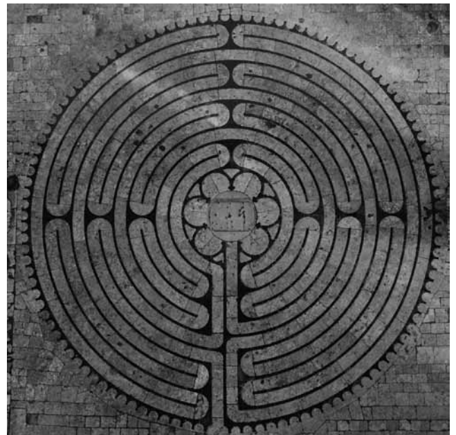
Fig. 5 - France, Chartres cathedral of Saint-Mary: the circular labyrinth on the floor of the central nave (13th century) (Adapted by J. Rodrigues).