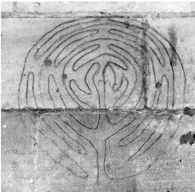
Fig. 4 - France, Poitiers cathedral of Saint-Peter: the labyrinth, etched on the Wall of a collateral aisle (probably 13th century).